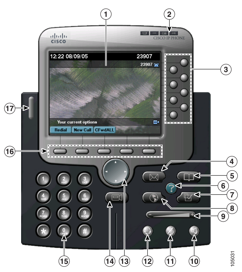
Table 1Buttons and Other Components